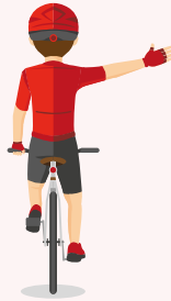
▶ Right turn