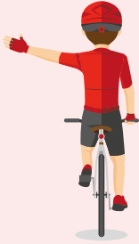
◀ Left turn

Although signals vary we've included some of the most common for you.