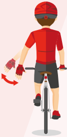
● Slow down