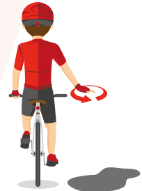
! Road hazard

Graphic adapted from illustration courtesy of Bicycle NSW. For more information visit: transport.nsw.gov.au/roadsafety