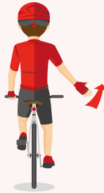
⤴ Give way